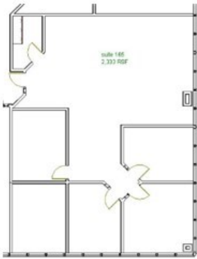
Suite 165 2,333 SF

7333 W. Jefferson Ave. Lakewood CO 80235